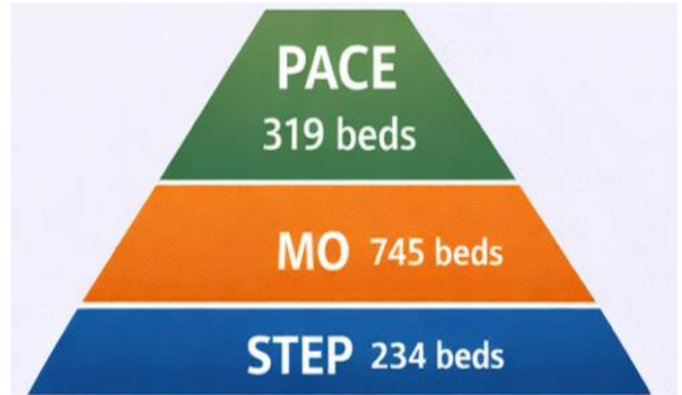
Revised MH THU continuum Total beds: 1298