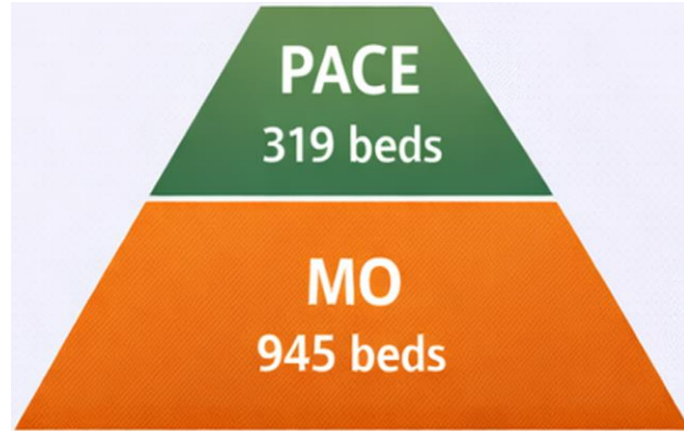
Previous MH THU continuum Total beds: 1264