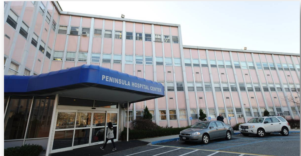
Peninsula Hospital (2012 Closure)