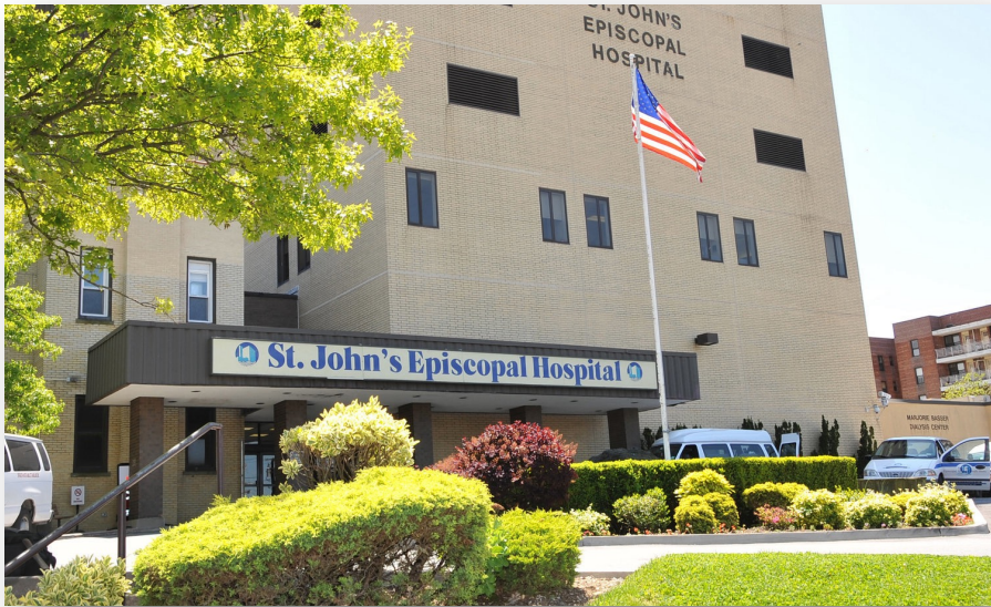
St. John's Episcopal