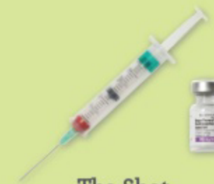
The Shot (Depo-Provera)