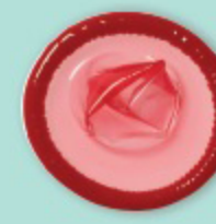
Condoms, for men and women